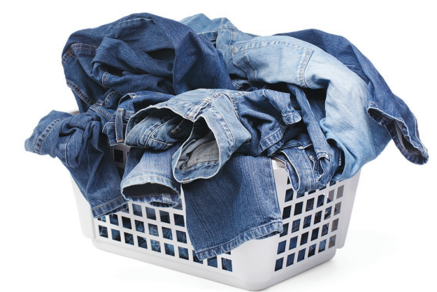
IN THE TIME IT TAKES TO UNLOAD YOUR LAUNDRY A CHILD COULD DROWN. IT TAKES AS FEW AS :30 SECONDS FOR A TODDLER TO DROWN.

A surprising number of drowning incidents occur when people are actively swimming or hanging around the pool or spa. It's important to remember whenever infants and toddlers are in or around water, an adult should be within an arm's length, providing "touch supervision." You must also remember flotation devices are not a substitute for supervision—"water wings" or "floaties," inflatable water rings, and other pool toys are NOT safety devices.